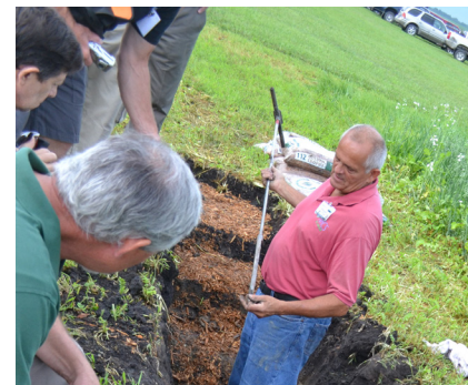
Field measurements help to validate remote sensing data.

During the intervening years, CTIC has championed efforts to re-start the collection and dissemination of data, leading to the collaboration with AGS and the Conservancy on OpTIS. Given the scale and importance of these data to stakeholders in government, industry, and academia, it is clear that even greater levels of public and private collaboration will be required to operationalize and sustain this effort at the national scale. AGS, CTIC, and the Conservancy are committed to making this vision a reality.